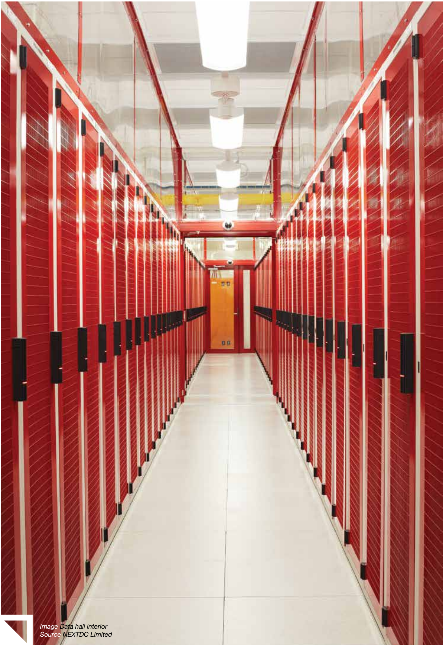
Image Data hall interior