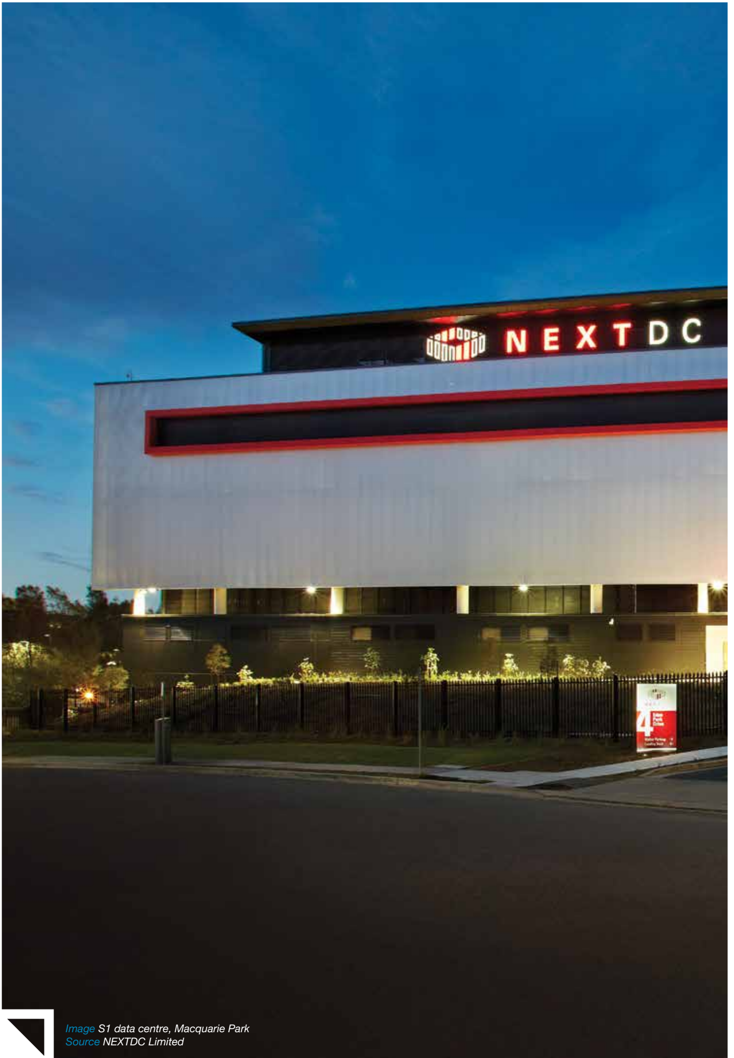
Image S1 data centre, Macquarie Park