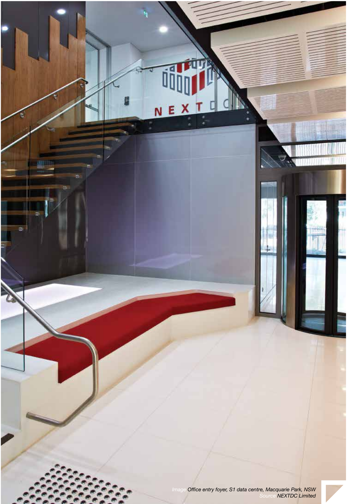
Image Office entry foyer, S1 data centre, Macquarie Park, NSW